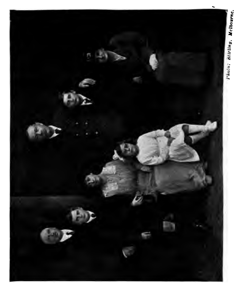
THE WANDERERS, 1920-21.